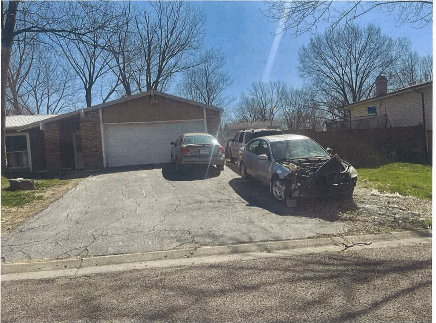
7204 N Moberly Dr Photos taken 3/14/23 ~11:00am