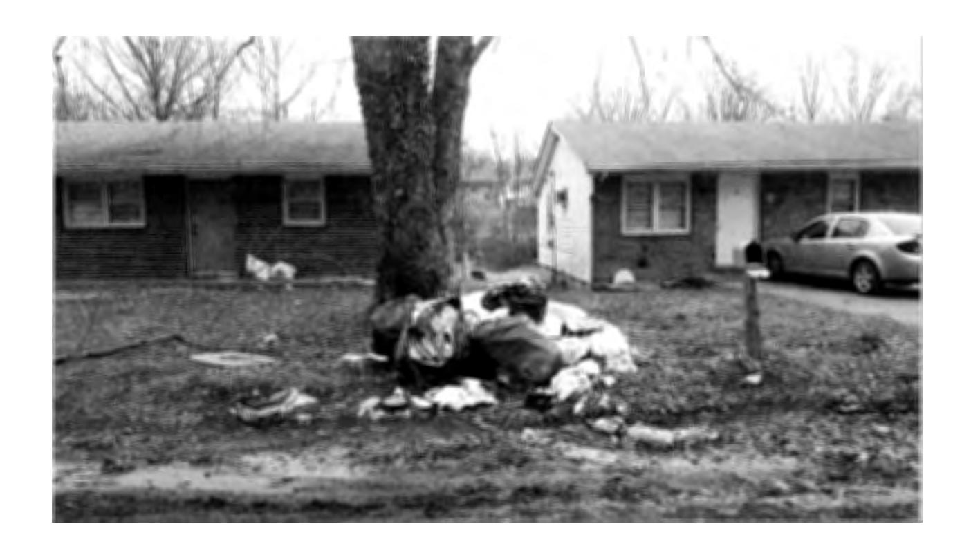
Photographs taken 1/23/17 @ ~ 3:00 pm 6004 N. Kent Drive A+B