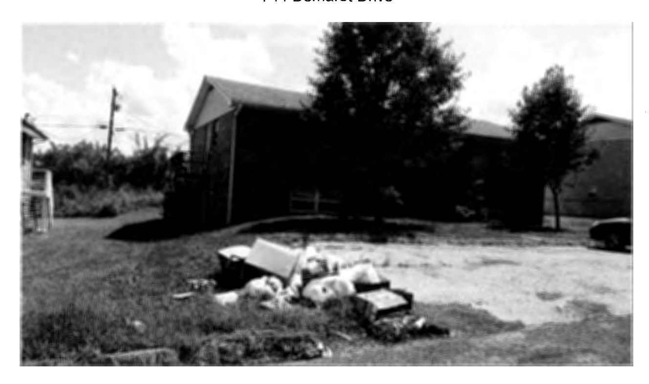
Photographs taken 7/27/16 @ ~ 3:00 pm 744 Demaret Drive