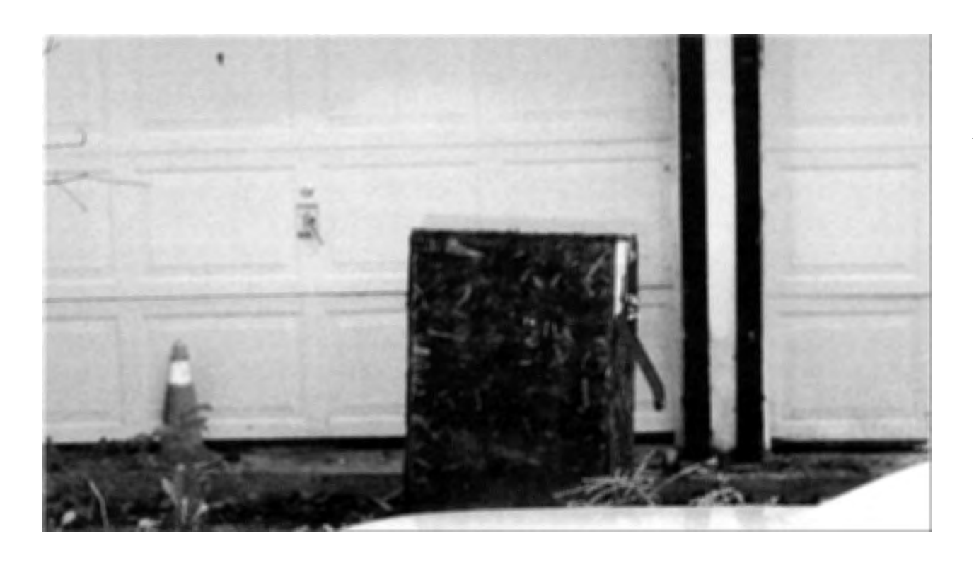
Photographs taken 7/22/16 @ ~ 10:15 am 6006 E. Robin Lane