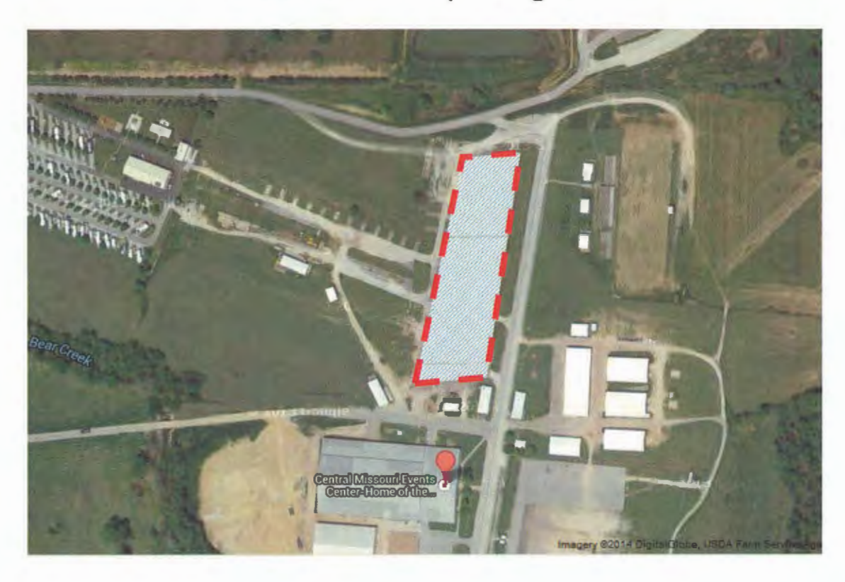
Exhibit A (8/26/2014) Boone County Fairgrounds