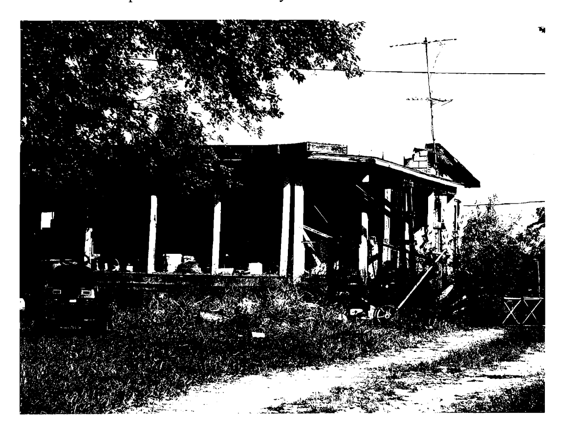
251 W Harper Road pictures taken 9/20/10 ~ 10:30am