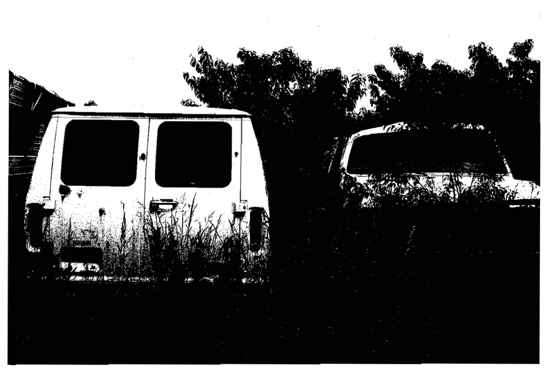
Close up of vehicles in pasture