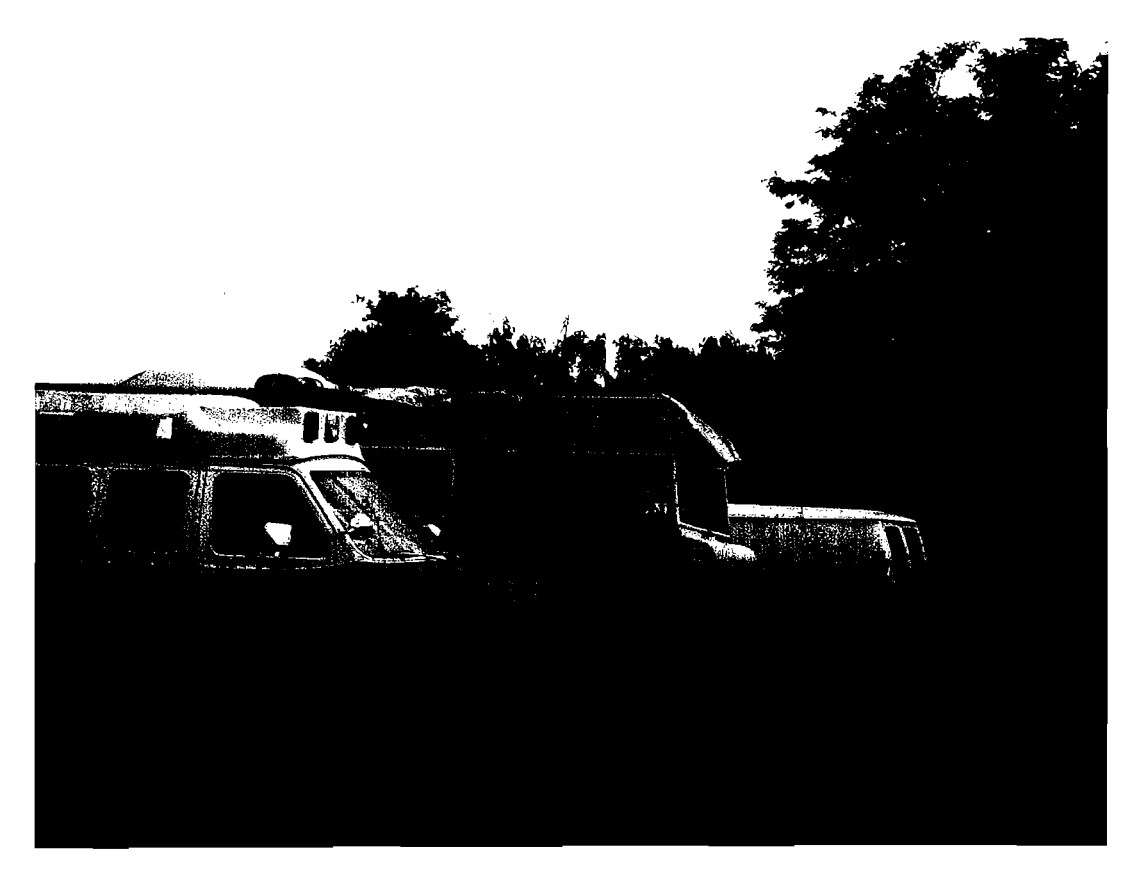
View of vehicles from end of driveway