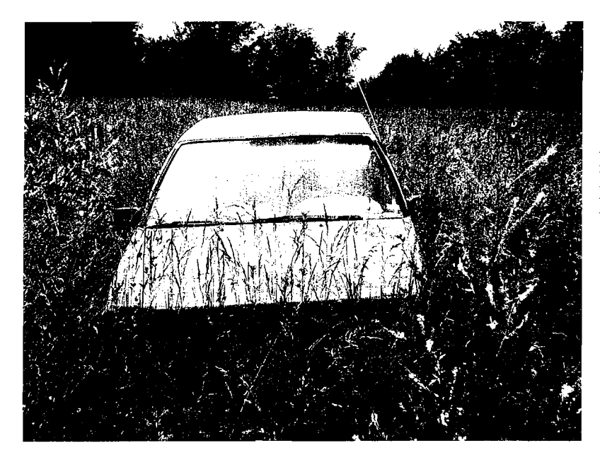
910 W Peabody Road 10 derelict vehicles in pasture. Pictures taken 6/1/10 by Kala Gunier