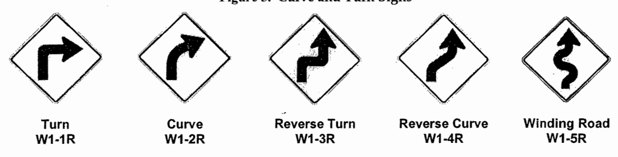
Figure 5. Curve and Turn Signs