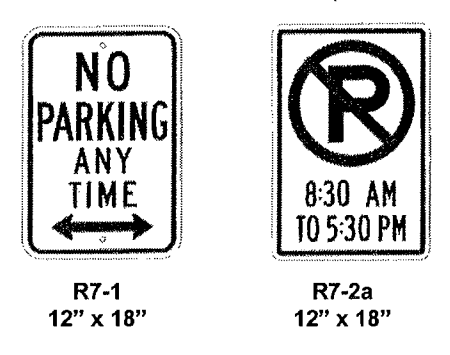
Figure 7. Parking Restriction Signs

In rural districts, special parking prohibition signs may be used to emphasize that no person shall stop, park, or leave standing any vehicle on the paved or traveled part of the highway. The legend on rural parking signs must be appropriate to the restrictions imposed. Figure 8 displays common rural parking restriction signs.