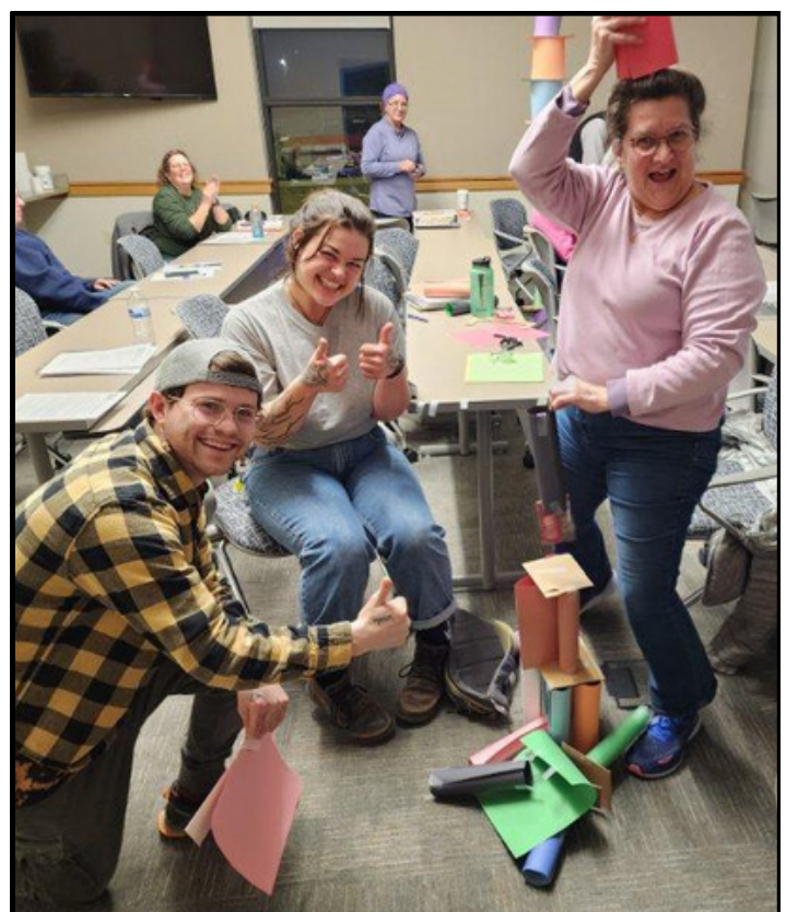
Photo: CERT members participating in team-building exercises.