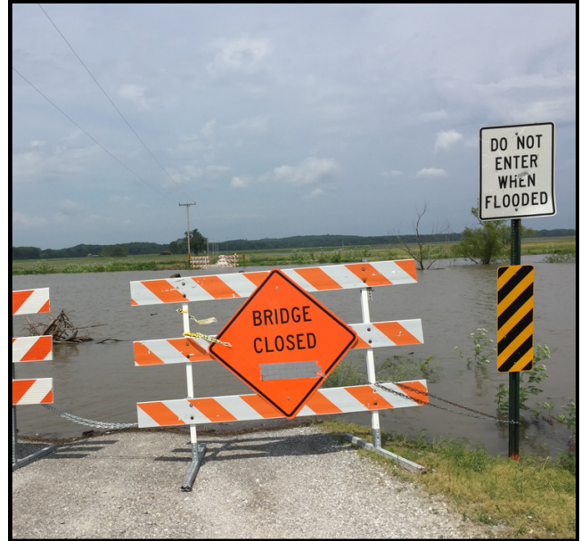
Photo: Rising flood waters in 2021 overtaking a bridge in Hartsburg, MO.

This flooding event was one of the worst floods on record in United States history. Financial losses totaled over $37 billion when adjusted for today's rates, with an incalculable loss to the environment and human suffering.