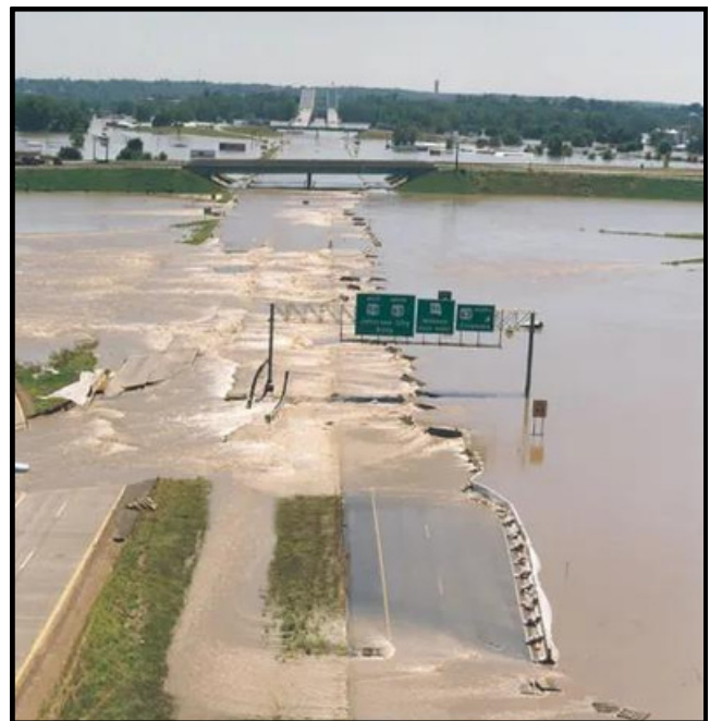
Photo: Missouri River flood waters swamping U.S Highway 54 July, 1993 (Missouri Department of Transportation).