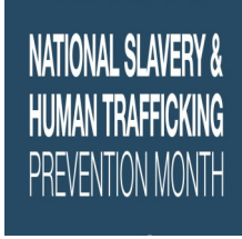
National Slavery & Human Trafficking Prevention Month