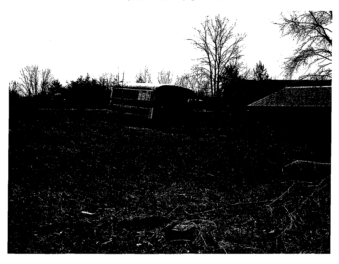
Derelict school bus 4/14/08 ~9:30AM