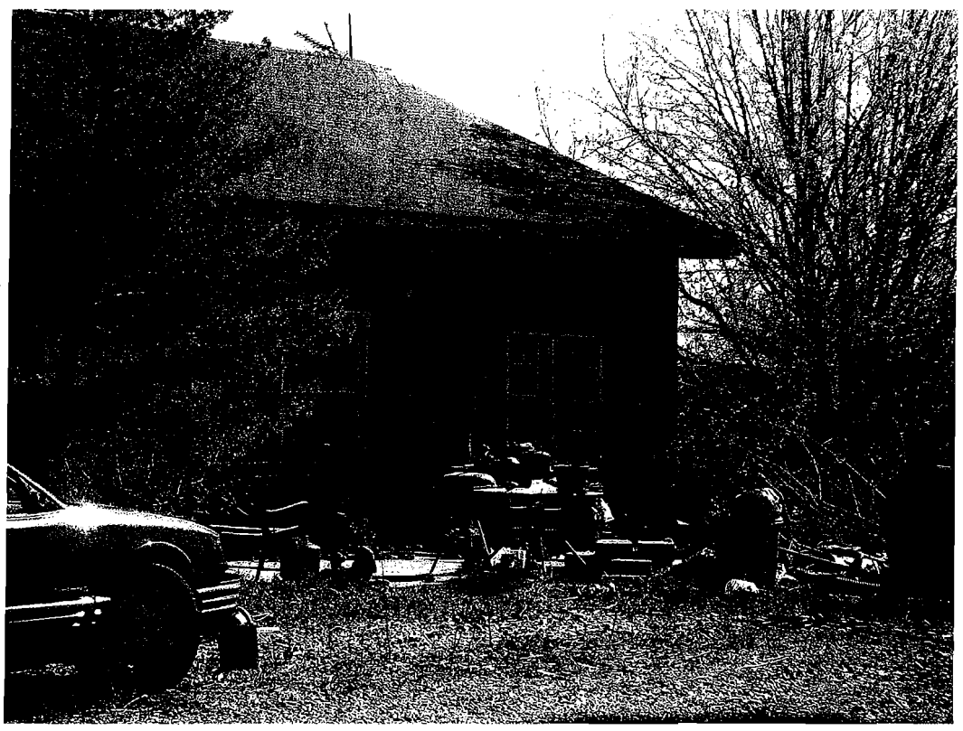
Trash and cans scattered in front of house 4/14/08 ~9:30AM