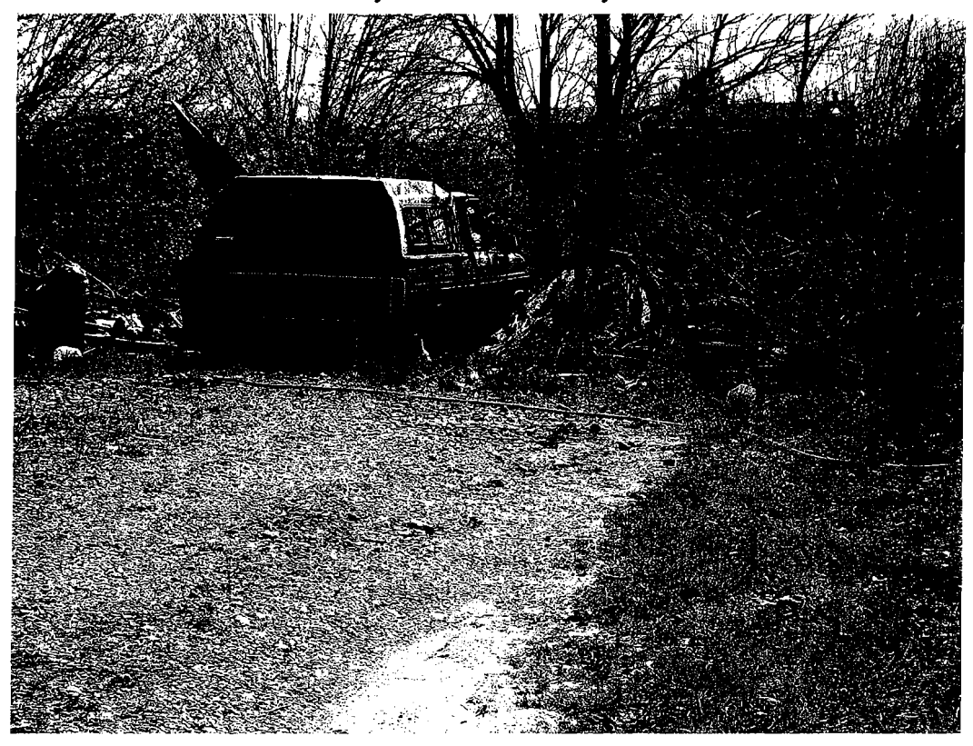
Derelict/unlicensed Red and Black Ford Truck