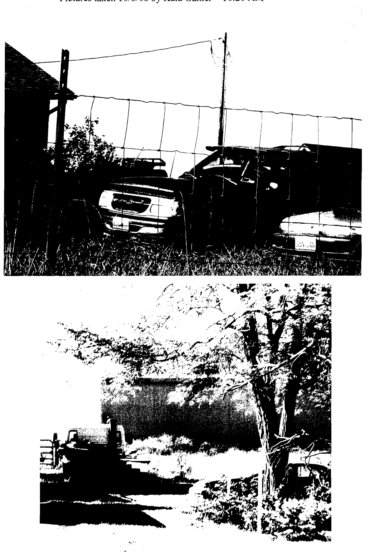
20501 N Route V: unlicensed/derelict/inoperable fray 4 door Ford Explorer and white flatbed truck on blocks. Pictures taken 10/8/08 by Kala Gunier ~ 10:20 AM